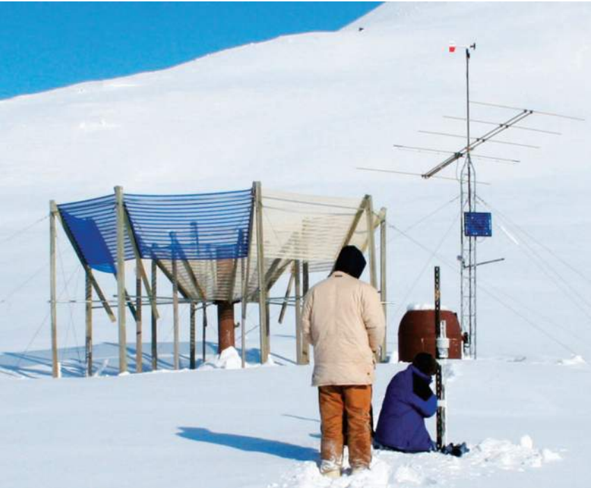
10.R24 131420A PROP - TYPE 14 REMOTE WEATHER STATION CR13.54 - PORTABLE WEATHER STATION - HTTPS://WWW.ONSETCOMP.COM/PRODUCTS/KIT/RX3004-SYS-KIT-813?CREATIVE=105859778421&KEYWORD=&MATCHTYPE=&NETWORK=G&DEVICE=C