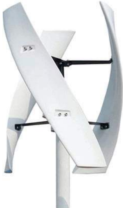
10.R25 131420A PROP - TYPE 15 WIND TURBINE CR13.54 - WIND TURBINE - 6-20FT MOUNTING HEIGHT - HTTPS://WWW.AMAZON.COM/QINGDONGDZA-VERTICAL-GENERATOR-12V-220V-CONTROLLER/DP/B09VC3TMG6/REF=CS_SR_DP?KEYWORDS=QINGDONGDZA&QID=1676944612&SR=8-2&TH=1