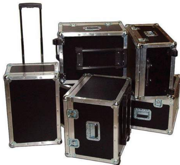
10.R31 131420A PROP - TYPE 21 ROAD CASE