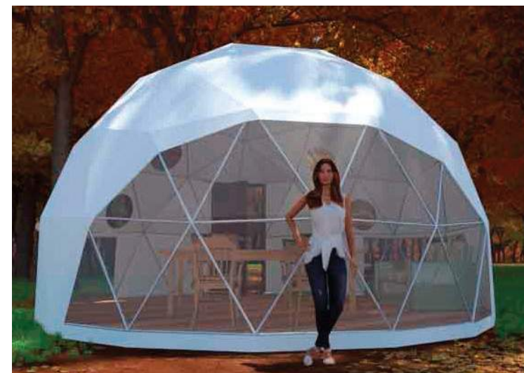
10.R32 131420A PROP - TYPE 22 GEO DOME