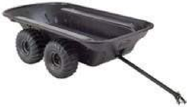
10.R22 131420A PROP - TYPE 12 XTV TRAILER ATTACHMENT CR13.54 - SMALL TRAILER THAT WOULD CARRY SUPPLIES - ATTACHED TO THE XTV - SHOWS MINOR WEAR AND TEAR - HTTPS://WWW.ARGOADVENTURE.COM/2023-ARGO-FRONTIER-650-6X6-STK-21454_P_101254.HTML?Gclid=EAIAIQOBCHMI1RJGZL-K_QIVX7QGCH0RAWGREAQYAIABEGKGV_D_BWE