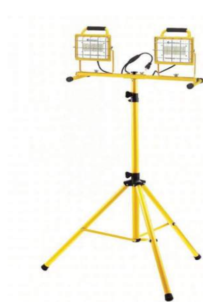
10.R29 131420A PROP - TYPE 25 LIGHT ON STAND CR13.56 - WORK LIGHT ON STAND - PAITING THAT SHOWS LIGHT WEAR AND TEAR - HTTPS://WWW.GRAINGER.COM/PRODUCT/SOUTHWIRE-TEMPORARY-JOB-SITE-LIGHT-13-45NL40