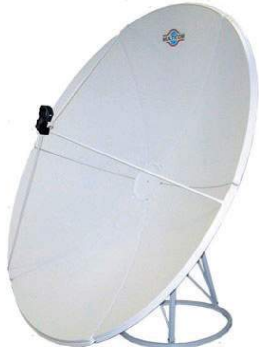
10.R23 131420A PROP - TYPE 13 SATELLITE DISH CR13.54 - 8' TALL SATELLITE DISH - MINOR WEAR AND TEAR. - HTTPS://MULTICOMSTORE.COM/MULTICOM-MUL-2-4M-C-BAND-2-4-METER-PRIME-FOCUS-SATELLITE-DISH.HTML?SRSLTID=AD5PG_FVOBSIR6WMMR6DSBM8HP_3OZAISFUHOAFPQLDCXK1M_B36XGDAVUJ4