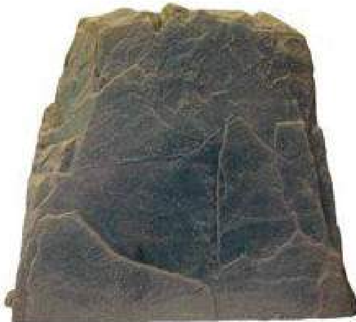
10.R28 131420A PROP - TYPE 18 ROCK COVER A