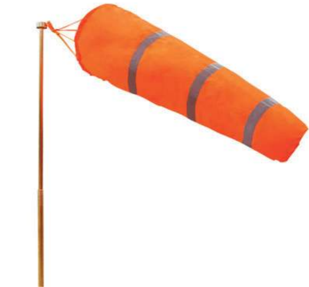
10.R27 131420A PROP - TYPE 23 WIND SOCK CR13.56 - ATV THAT SHOW LIGHT WEAR AND TEAR - WWW.FUNBIKE.COM/DEFAULT.ASP?PAGE=XINVENTORYDETAIL&ID=13129122&P=1&AC=DUAL%20SPORT%7COFF-ROAD%7CSIDE%20BY%20SIDE%7CUTILITY%7CYOUTH&S=YEAR&D=D&FR=XALLINVENTORY