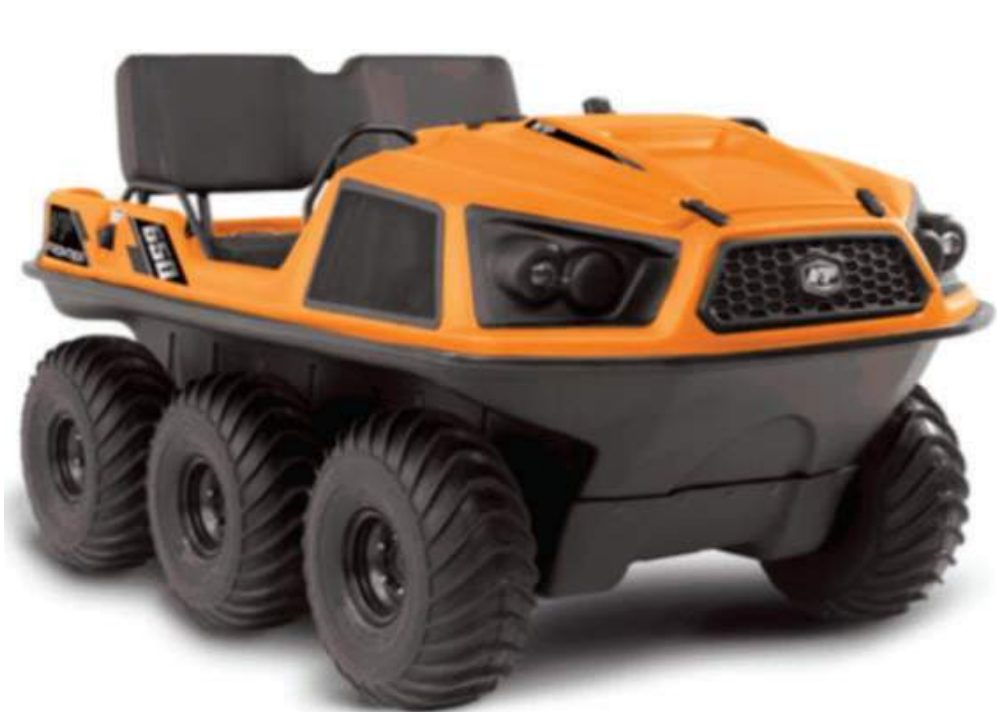
10.R21 131420A PROP - TYPE 11 XTV CR13.54 - XTV/ALL TERRAIN VEHICLE THAT COULD BE SEEN IN THE ARCITC - PAINT SHOW SOME LIGHT WEAR AND TEAR AND REMNANTS OF SNOW AND ICE - HTTPS://WWW.ARGOADVENTURE.COM/2022-ARGO-FRONTIER-650-6X6-STK-21210_P_100953.HTML