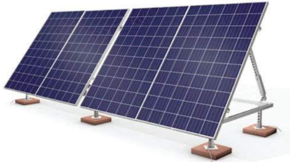
10.R26 131420A PROP - TYPE 16 SOLAR PANELS CR13.54 - SOLAR PANELS - SHOW LIGHT WEAR AND TEAR, AS IF THEY HAVE BEEN MOVED AROUND A FEW TIMES. - HTTPS://WWW.LOWES.COM/PD/SOLARPOD-SOLARPOD-GRID-TIED-PORTABLE-SOLAR-POWER-KIT/50273387?CM_MMC=SHP_-C_-PRD_-SOL_-GGL_-PLA_SOL_240_PRESSURE-WASHERS-GENERATORS_-50273387_-ONLINE_-0_-0&DS_RL=1286981&GCLID=EAIAIQOBCHMIRCAJ-QK_QIVLESGCH0DKGXWEAQYDIABEGLPLVD_BWE&GCLSRC=AW.DS