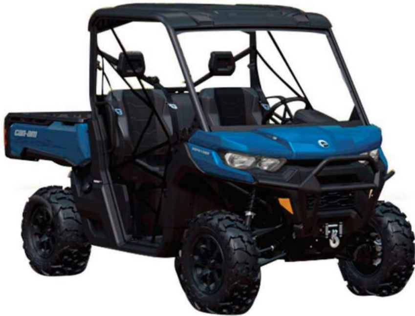
10.R27 131420A PROP - TYPE 17 DEFENDER XT