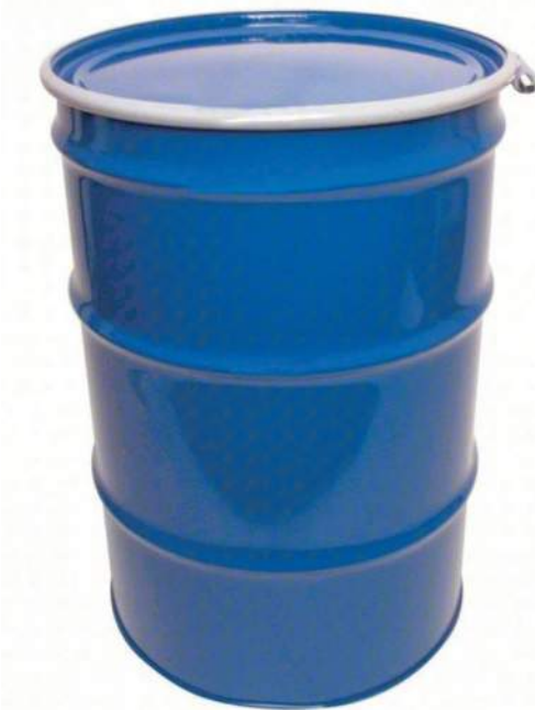
10.R28 131420A PROP - TYPE 24 BARRELL CR13.56 - STEEL DRUM BARRELL - PAINTED TO SHOW LIGHT WEAR AND TEAR - HTTPS://WWW.GRAINGER.COM/PRODUCT/23Y332?GUCID=N:N:PS:PAID:GGL:CSM-2293:99F1R6:20501231&GCLID=CJWKCAJW_MQGBHAGEIWANYOAEJWTSUZCS9-