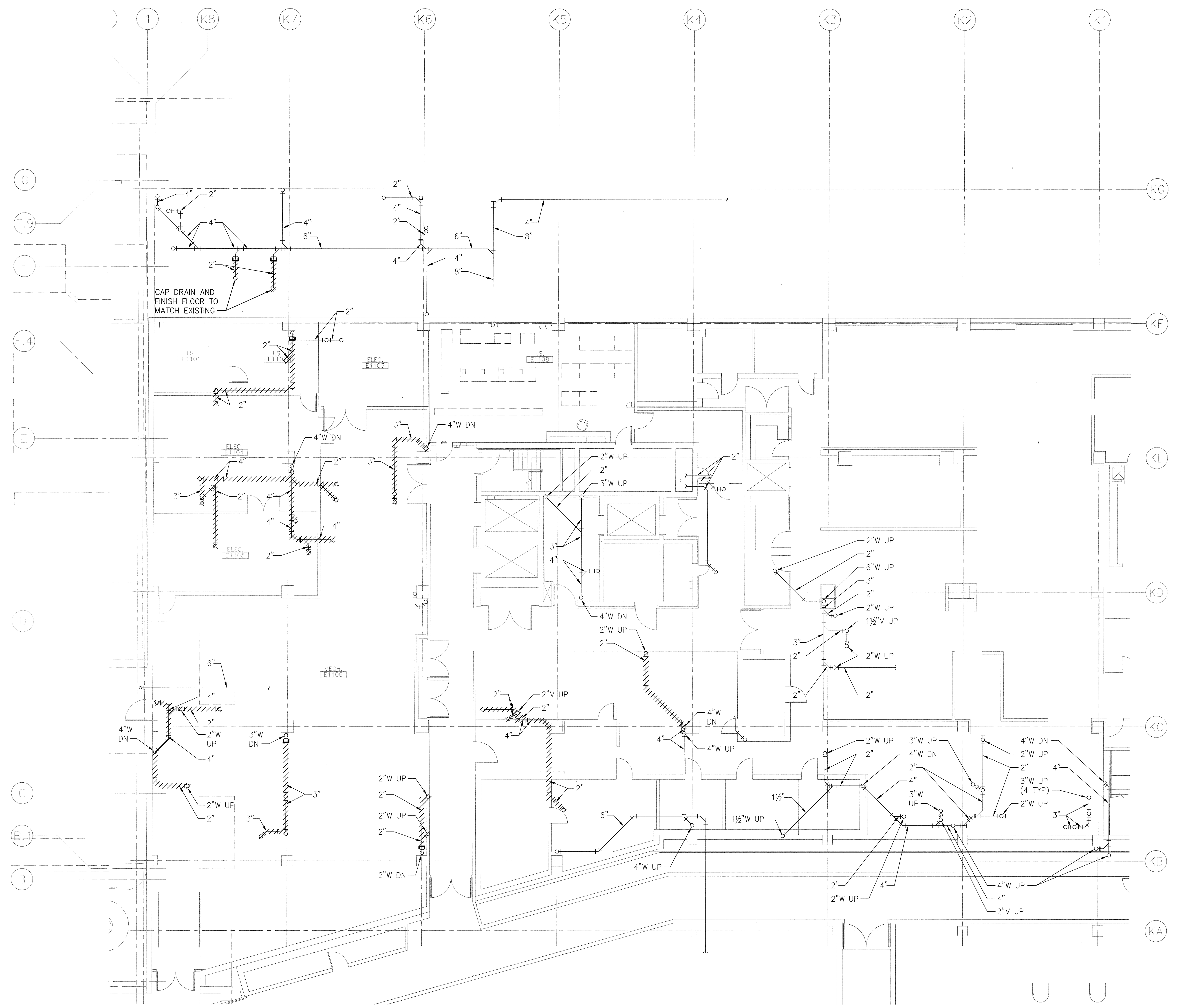
1ST FLOOR PLAN - K WING - PLUMBING DEMOLITION SCALE: 1/8"=1'-0"