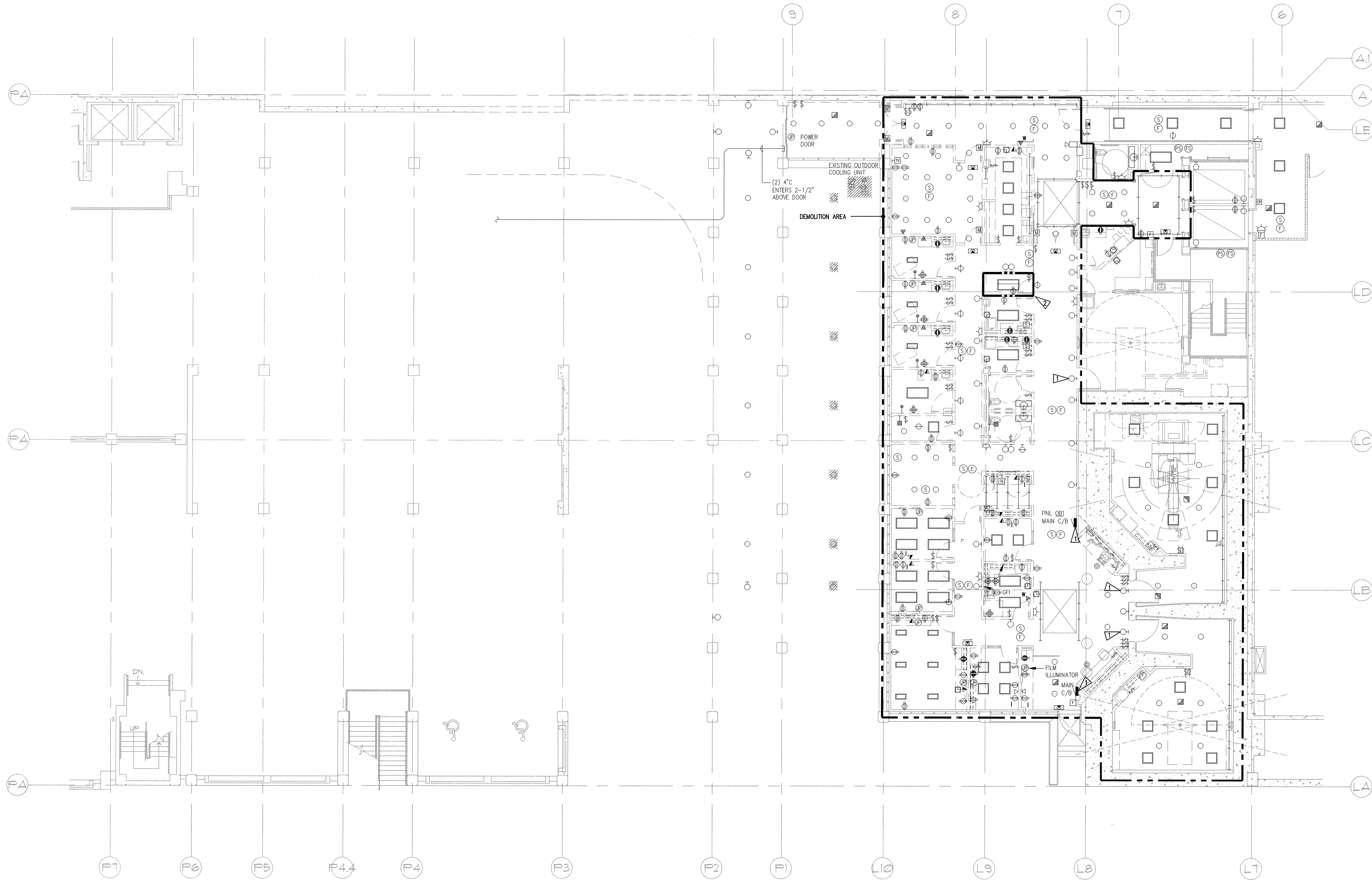
1 FIRST FLOOR L-WING DEMOLITION PLAN - ELECTRICAL E1.31 SCALE: AS INDICATED 0 4 8 16 24 as indicated feet

SPARLING ELECTRICAL ENGINEERING / TECHNOLOGY CONSULTING