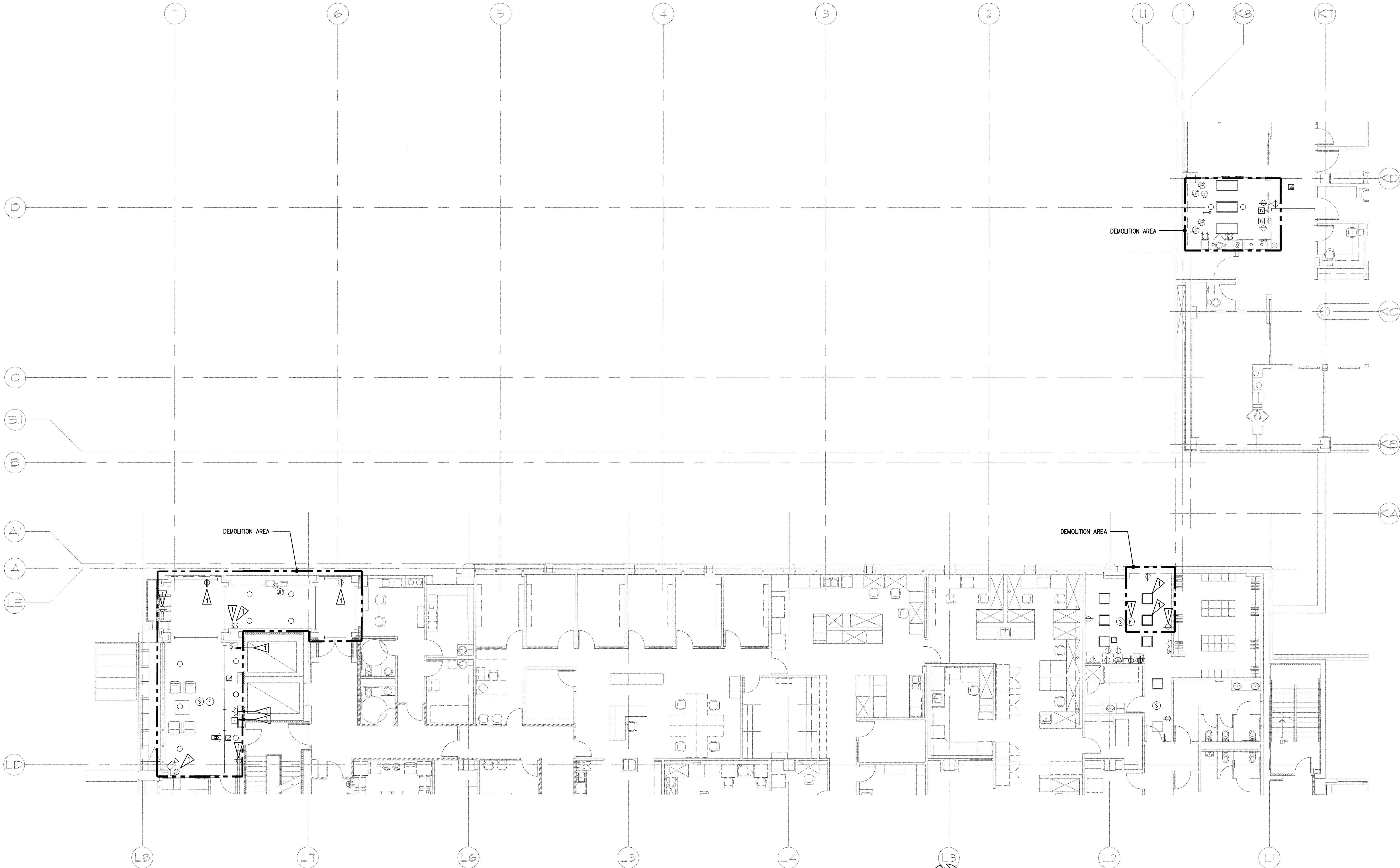
1 FOURTH FLOOR K-WING & L-WING DEMOLITION PLAN - ELECTRICAL E1.34 SCALE: AS INDICATED 0 4 8 16 24 feet

SPARLING ELECTRICAL ENGINEERING | TECHNOLOGY CONSULTING