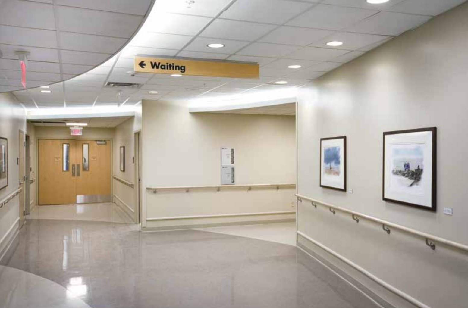
Rx Symphony® m Trim (1222)