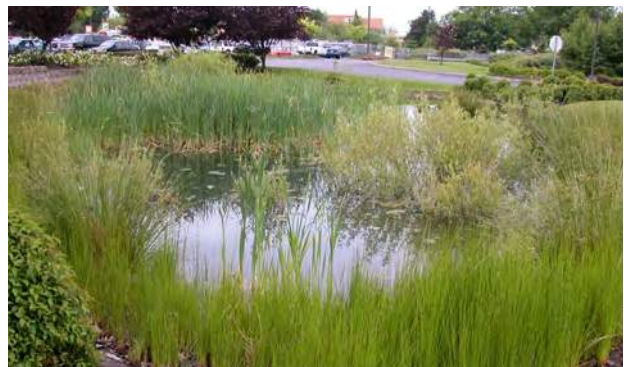
Home Depot, Glenn Widing Drive, North Portland

Extended dry basins may help fulfill a site's landscaping area requirement. This type of swale is approved to treat stormwater from all types of impervious surfaces, including private property and the public right-of-way, rooftops, parking lots, and streets.