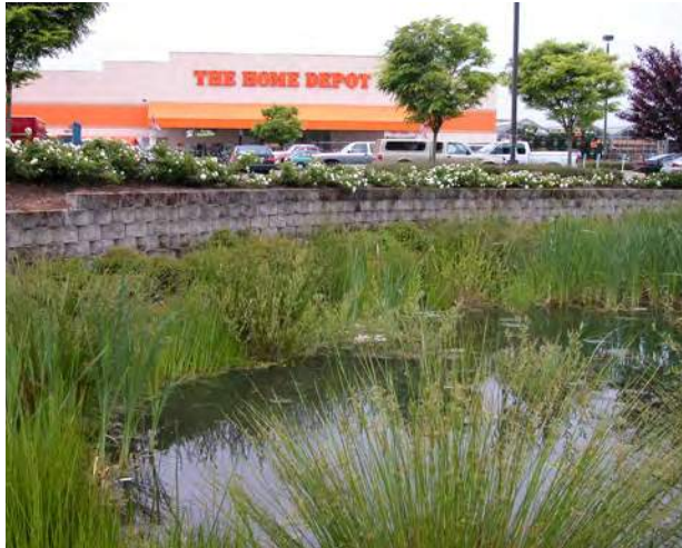
Home Depot, Glenn Widing Drive, North Portland