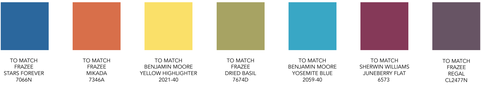
Children's Miracle Network Campaign Donor Graphics