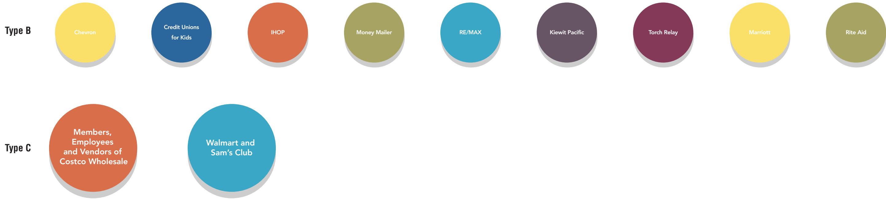
1 Donor Name Layouts as of (09/25/2012)

LAYOUTS SHOWN REFLECT ALL DONOR NAMES RECEIVED AT THIS TIME. FABRICATOR IS TO PROVIDE ALL DISCS PER THE QUANTITIES ON DRAWING 2 (BELOW)