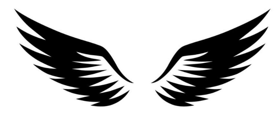
Flywall Construction Inc.